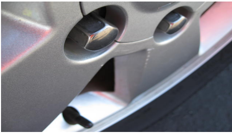
Minor scuffing non-chargeable