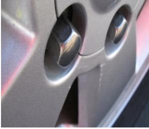
Minor scuff non-chargeable

Light scratches that can be repaired with light sanding will be charged a $50.00 MET Appearance Fee