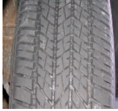
Non Measureable Sipe Tread

Measurable Tread Grooves Must be a Minimum of 5/32".